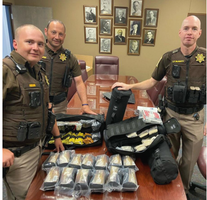
▲ Pictured: Single use supplies like tourniquets, combat gauze, downed officer kits, and facial shields are used very quickly during crises

This Manikin pushes the limits of knowledge and skill. Think of this as a "flight-simulator" for first responders to practice, correct their errors, and prepare for actual traumas.